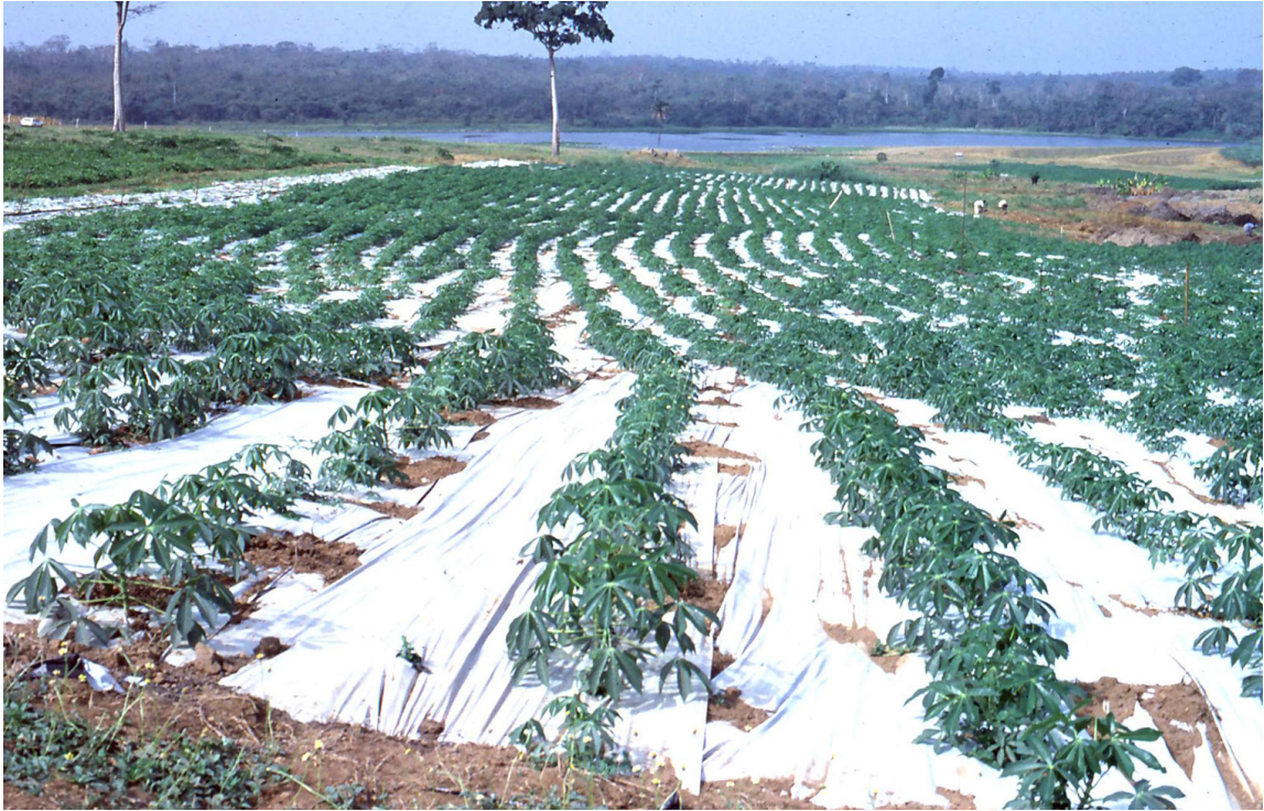
Fig. 2a. Cassava ( Manihoc esculenta ) cultivation with clear plastic mulch for moisture conservation and weed suppression in western Nigeria.