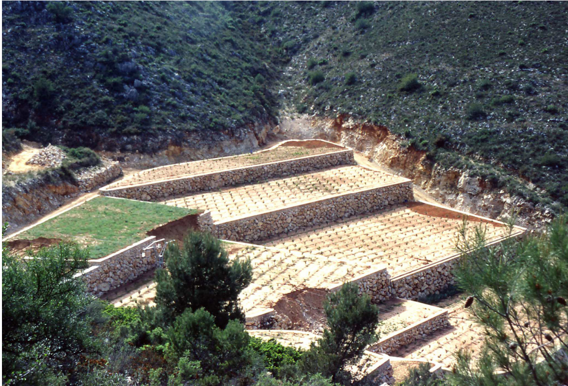
Fig. 5. Fruit terraces for citrus plantation in Valencia, Spain.