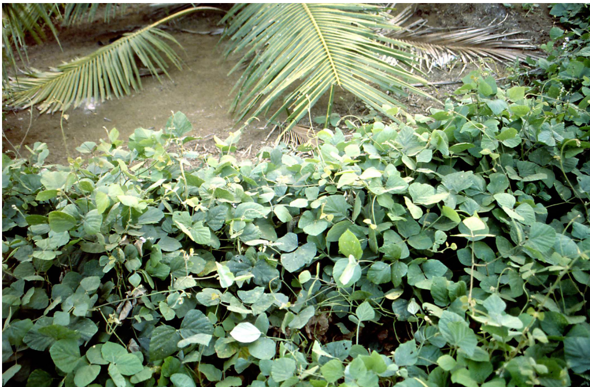
Fig. 4. Use of kudzu ( Pueraria phaseolides ) in between coconut trees in Java, Indonesia.