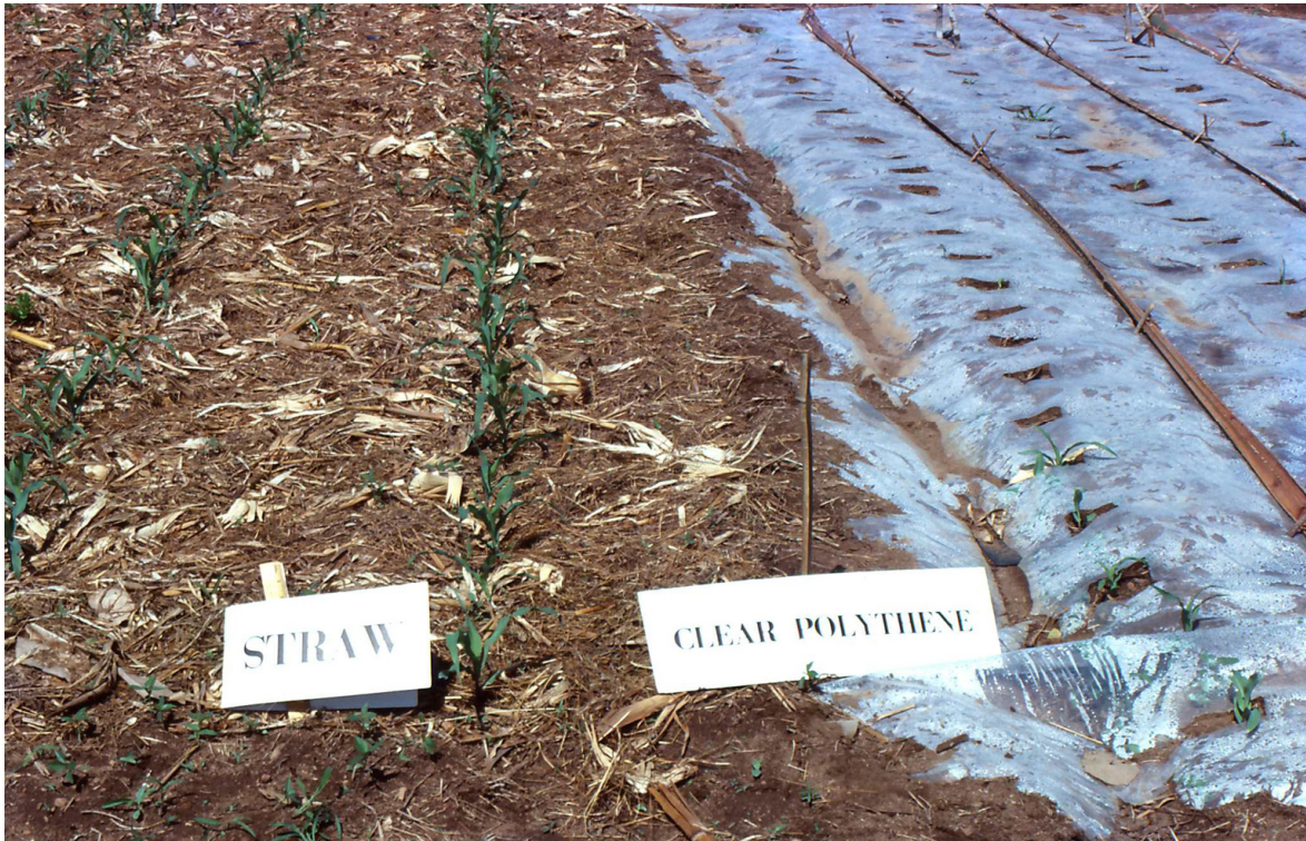
Fig. 3. Field experiments on comparison of soil moisture and temperature regimes under straw mulch and clear plastic on Alfisols in western Nigeria.