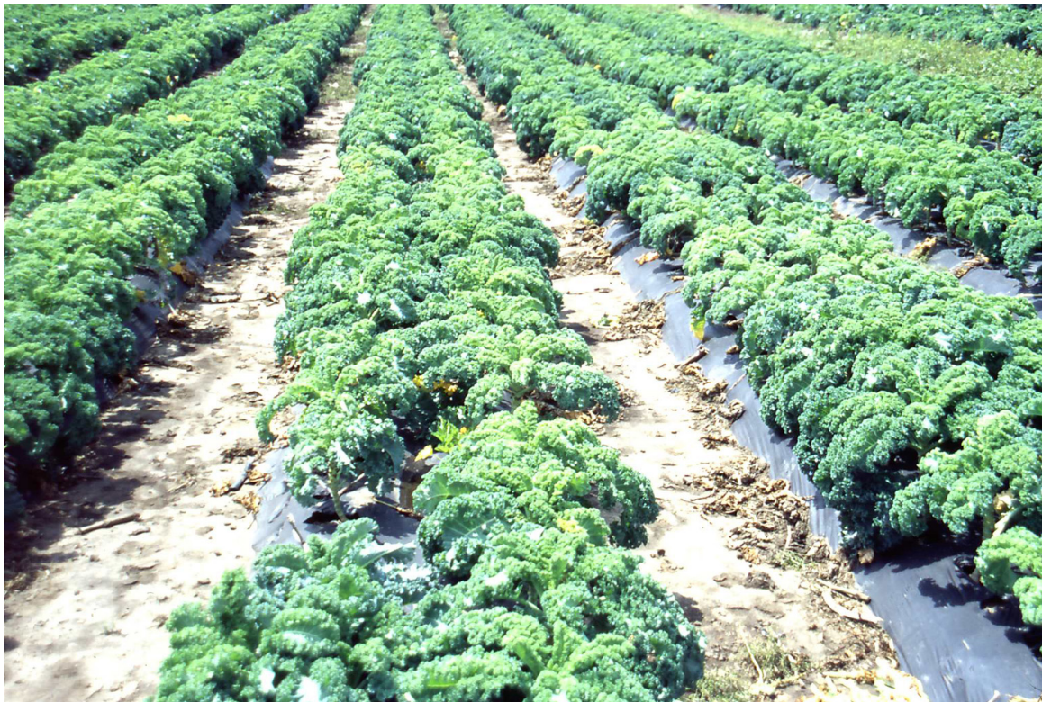
Fig. 2b. Use of black plastic for vegetable production in Willard, Ohio, USA.